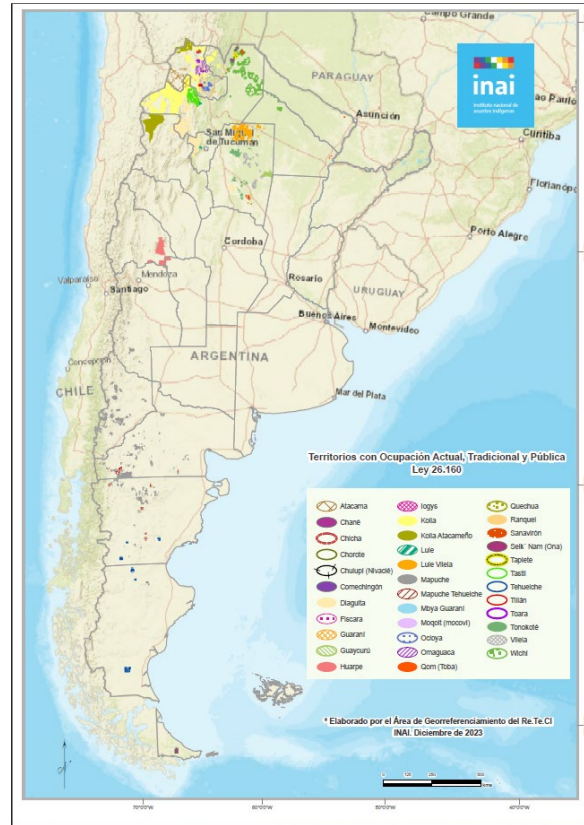
Figure 6. Map of territories with current, traditional and public occupation (Law 26,160) of the Indigenous Affairs Institute.

Worms Argentina S.A. is the owner of the land and the main stakeholder and responsible for production, assuming all the costs, risks and will be the one in control of the carbon rights that will remain in its entirety with in the company.